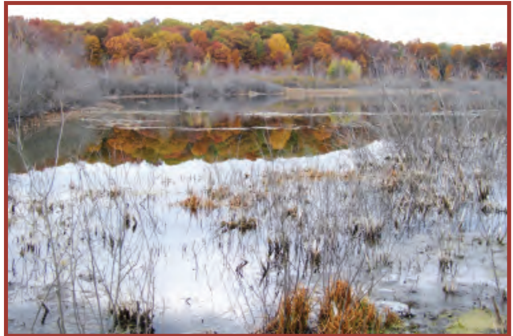
This scenic view is the Mud Lake area of Prairieville Creek, looking west.

Prairieville Creek has an extraordinarily high rate of groundwater discharge, which produces very stable and consistent water flow and temperature. Emerging groundwater averages 50°F all year, so the creek never freezes for