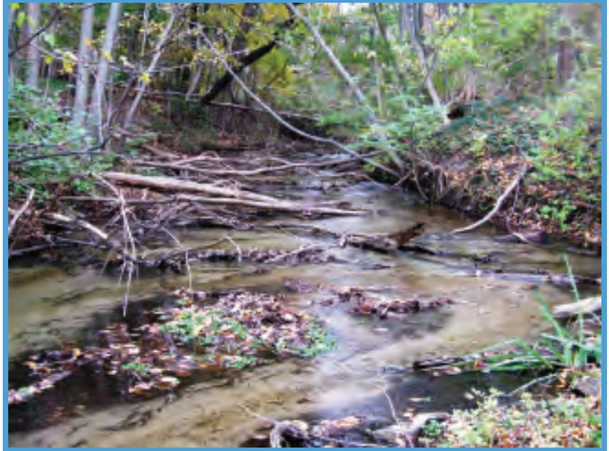
This photo is of the lower creek corridor of Prairieville Creek, just north of M-43 before it empties into Gull Lake. Although the water here is clear, this view shows damage by erosion and sedimentation.

To learn more or to support our efforts, call the SWMLC office at (269) 324-1600.