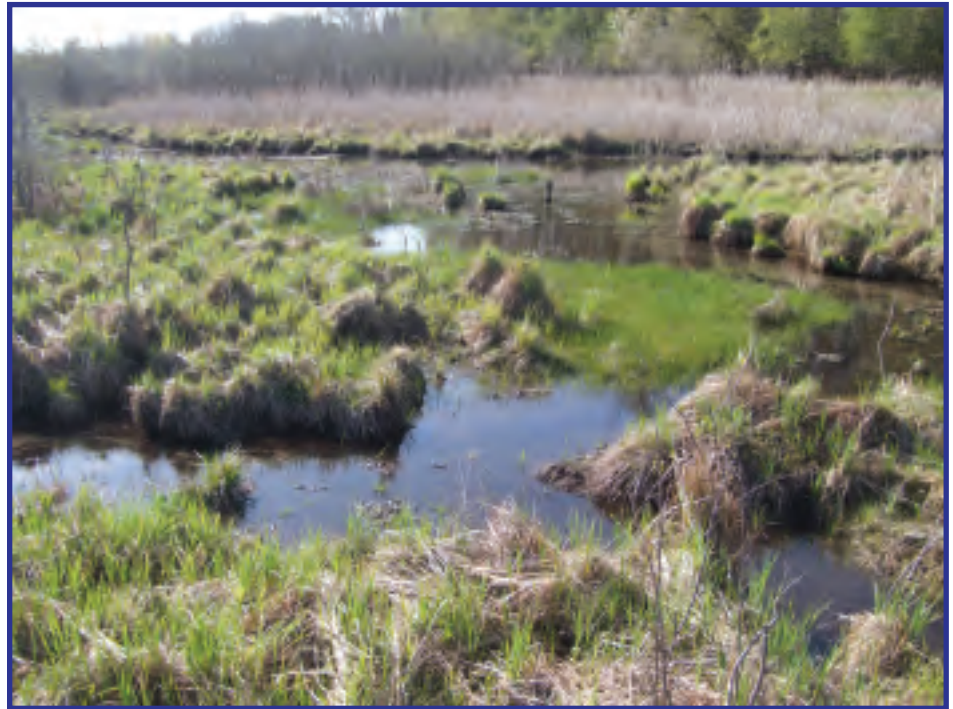
This prairie fen contains numerous seeps and springs which supply groundwater to the creek and provide critical waterfowl habitat.

In order to mitigate the threats and protect the water quality, water quantity, and wildlife habitat, SWMLC and the planning team developed nine action steps within the three conservation areas (headwaters prairie fen and springs, Mud Lake area, and lower creek corridor). The key component for protecting these three areas is the conservation and management of the creek corridor and wetlands, and the creation of a 100-foot buffer surrounding this area. The chart below lists the action steps that SWMLC and the planning team will implement to protect the Prairieville Creek Watershed.